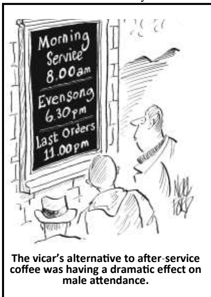
The vicar's alternative to after-service coffee was having a dramatic effect on male attendance.