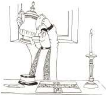
The special silverware only came out once a year.

Village hall: There will be no pub night in December but there will be one on January 29, possibly combined with a whisky tasting to honour a well-known Scottish poet. A curry night is planned for February 26. If anyone is prepared to help run the bar, the committee would be very grateful.