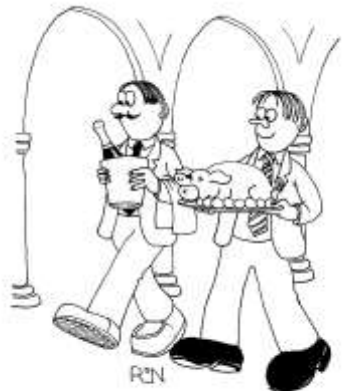
It had started with coffee and biscuits after the service.